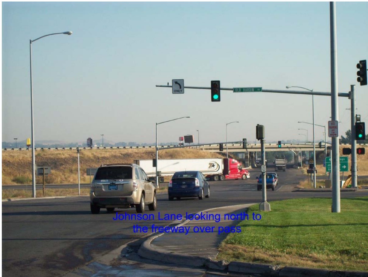
Johnson Lane looking north to the freeway over pass